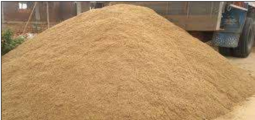
Figure 1: Natural sand

The term "sand" used in the construction and construction industry is synonymous with fine-grained material having a particle size of less than 5 mm. Sand is located in the construction industry all over the world and is an important raw material for providing infrastructure and housing. The main purpose of sand is to make concrete and concrete products, such as ready-mixed concrete block products, columns, stumps, manholes, pipes, plates, beams, walls, roof tiles and various other products. Standards require sand to have physical and chemical characteristics such as particle size distribution limitations, hardness, inertness, water absorption limit, density, mineral type, durability, and no harmful substances [10].