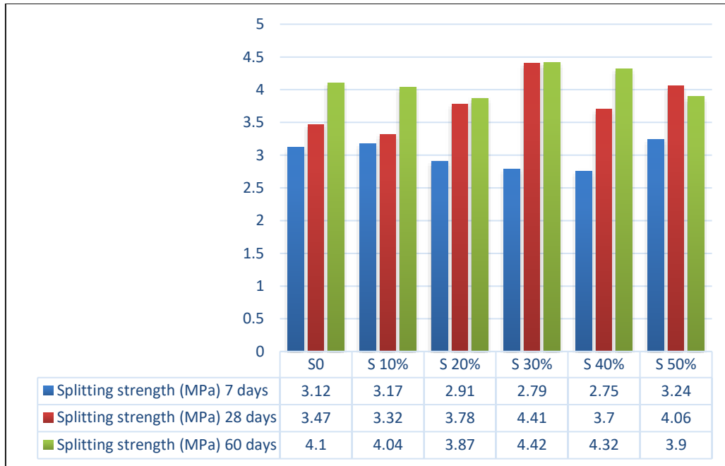
Figure (6) Splitting Strength (MPa) for the Cylinder

Figure 6 shows the comparison for splitting strength of a concrete that has been constructed within 7 days a, 28 days and 60 days. As it can be seen from figure 5 that the splitting strength for the control sample has been constructed and tested after 7 days achieved a high strength at 50% compared to the concrete with replacement of porcelain over the sand at a small scale as in the 7 days 3.12 MPa and in the 50% increased to 3.24 and for the 60 days the control were 4.1 MPa while for the highest achieved on the 30% which is 4.42 MPa that approve that the porcelain replacement can increase from the splitting of the concrete which not good by the incensement of porcelain percentage . On other hand, there is a remarkable increase for the concrete after 28 days at 30% compare to the conventional concrete with 4.41 MPa and 3.47 MPa respectively.