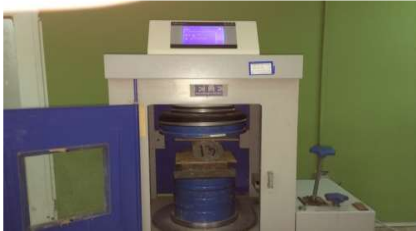
Fig (5) Splitting tensile machine test

was considered. The average values of 3 specimens for each category at the ages of 7 days, 28 days and 60 days are shown in the Figure 5.