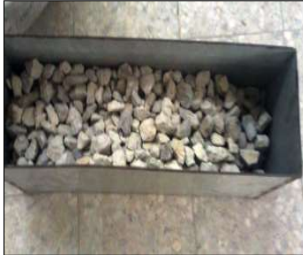
Figure 2: Coarse Aggregate

12.5 mm size for the coarse aggregate left on the screen. The function of coarse Aggregate is to serve as the main load-bearing component of concrete.