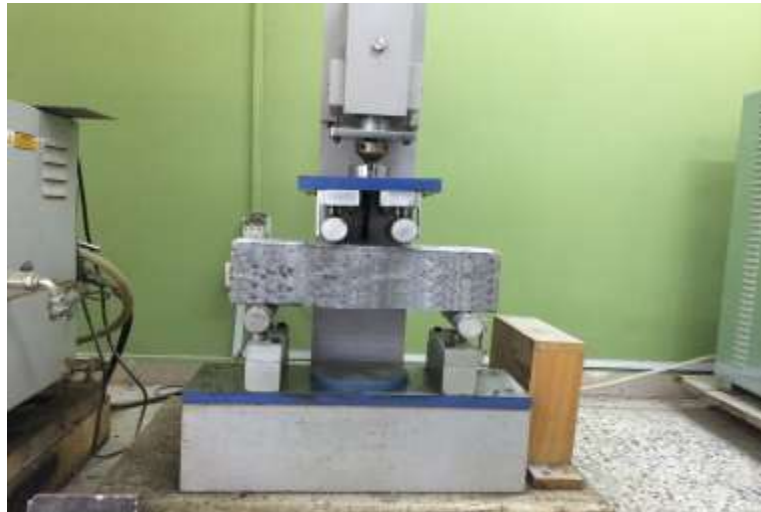
Fig (7) Flexural strength test

testing setup. The strength of a material in bending, expressed as the stress on the outermost fibres of a bent test specimen, at the instant of failure. Prism specimens were tested for flexural strength. The tests were carried out confirming to IS: 516-1959 (8). The specimens are tested under two-point loading. The average value of two specimens for each category at the age of 7 days, 28 days and 60 days is shown in Figure. 7.