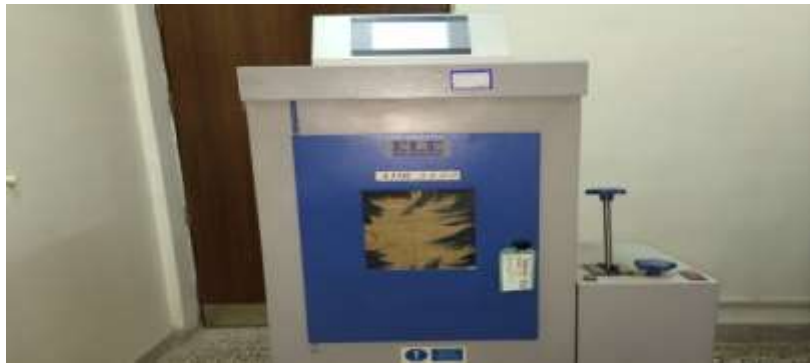
Fig (3) Compressive strength machine test

Compressive strength test is the most common test conducted on concrete, because it is the desirable characteristic properties of concrete are quantitatively related to its compressive strength [12-13]. Compressive strength was determined by using Compression Testing Machine (CTM) of 2000 kN capacity. The compressive strength of concrete was tested using 100 mm x 100 mm x 100 mm cube specimens. The test was carried out by placing a specimen between the loading surfaces of a Compression Testing Machine (CTM) and the load was applied until the specimen fails. Three test specimens were cast for each proportion and used to measure the compressive strength for each test conditions and average value was considered. The average value of compressive strength of 3 specimens for each category at the age of 7 days, 28 days and 60 days are shown below.